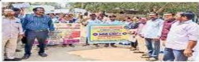
పెరుమాళ్లపురంలో విద్యార్థులు, వైద్య సిబ్బంది ర్యాలీ