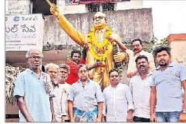
ఏలేశ్వరంలో అంబేద్కర్ విగ్రహానికి నివాళులర్పిస్తున్న వైఎస్సార్ సీపీ నాయకులు